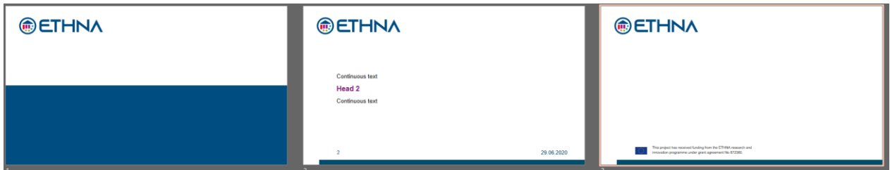
Figure 2: Powerpoint Template