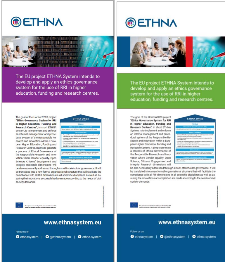
Figure 4: Roll-ups

A roll-up has been designed that can be used at future events to bring across the basic information on ETHNA System. The roll-up can be translated into any language required for the partners. Due to the current Covid-19 situation, the roll-up will not be printed at this point.