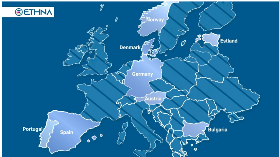
Still Image 7: ETHNA System-Implementation (different institutions)