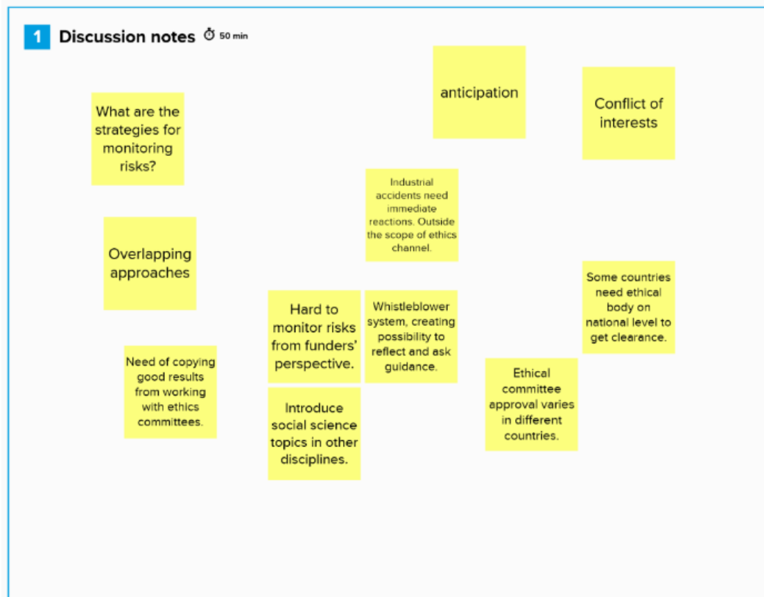
Fig. 3: Screenshot of the discussion notes on a Mural board – External Stakeholders' workshop

After having inquired the stakeholders about their experience of being consulted within the ETHNA System implementation, the floor was open for questions, and some issues on ethical governance were discussed among the participants. A summary of the main issues discussed follows below.