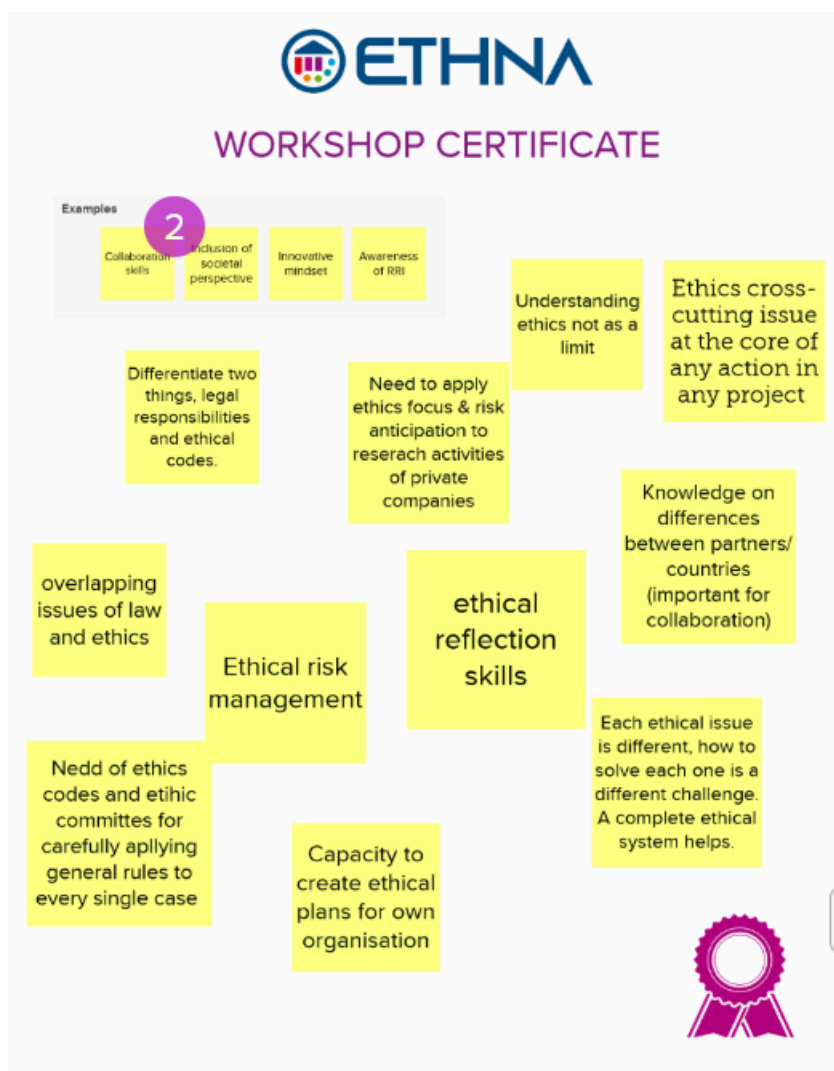
Fig. 4: Screenshot of the final takeaway task on the Mural board – External Stakeholders' workshop